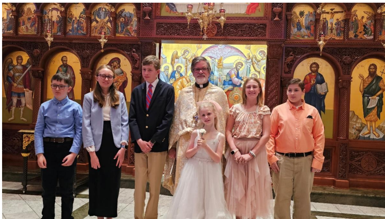
St. Paul's Local Festival

Our Parish Oratorical Festival was held on March 23, and the District Festival was held in Brunswick on March 29.